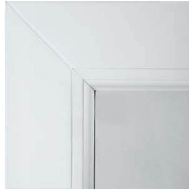
Panel Weld & Bead Detail