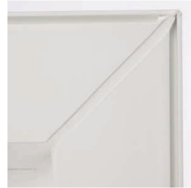
Clean, detailed welded corners