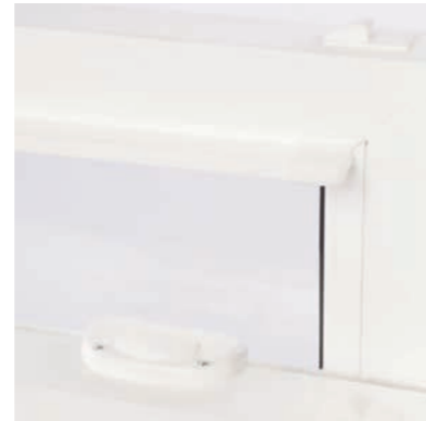
Tilt latches and locks