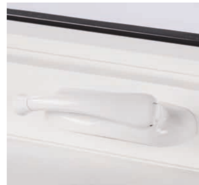
High quality hardware